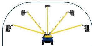
*solution at customer responsibility