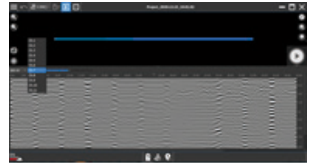
AM Data Logger Acquisition software