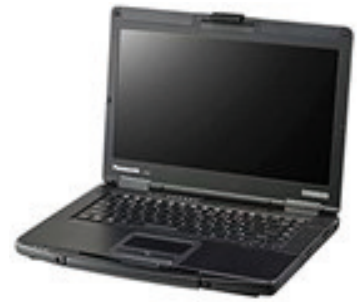
PC Data Logger