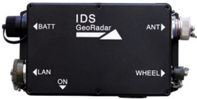
Mini Supply Control Unit