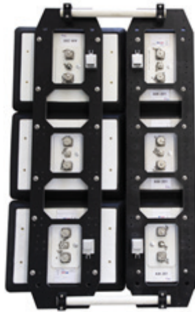
GPR array modules